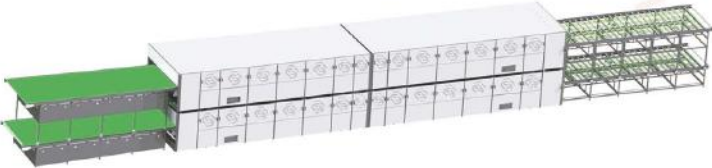
双层双腔层压机 Double-layer& double-chamber Laminator