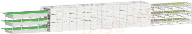
三层双腔层压机 Three-layer& double-chamber Laminator