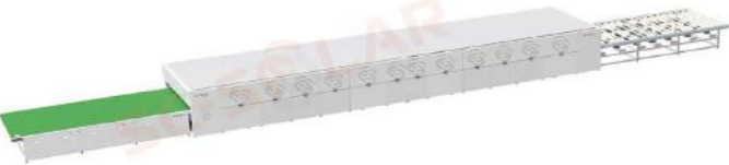
单层双腔层压机 Single-layer& double-chamber Laminator

Laminator heating method: oil heating and electric heating, other sizes as per customer requirements will be customized.